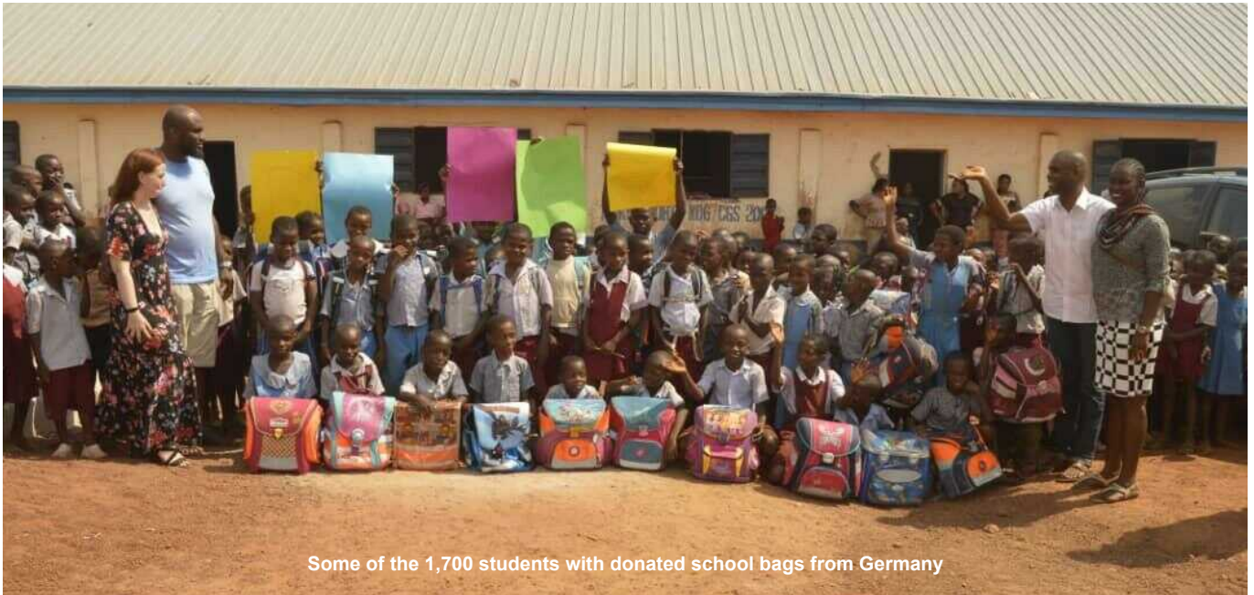
Some of the 1,700 students with donated school bags from Germany

Holyrock, Mountain of Light Church Amuro/Mgbom, Ebony State